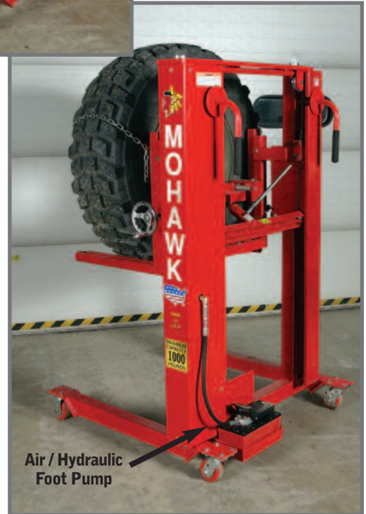
Air / Hydraulic Foot Pump