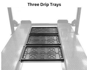
Three Drip Trays