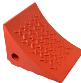
Urethane Wheel Chock