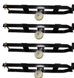
Caster Kit with Polyurethane Wheels