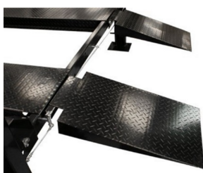
Steel Approach Ramps